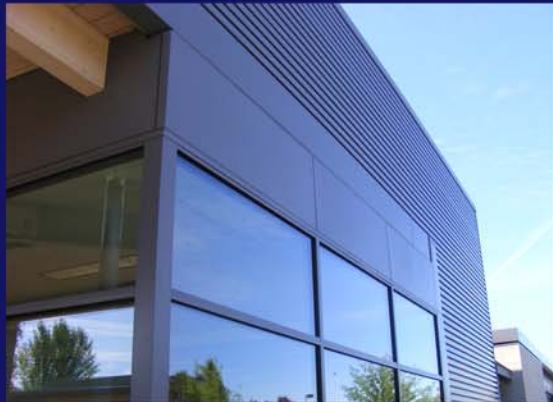
NIKE EARLY CHILDHOOD DEVELOPMENT CTR. 1234 SW BURLINGTON DR. BEAVERTON OR 97006 COMPLETED 2008 INSTALLER: PORTLAND SHEET METAL ARCHITECT: TVA ARCHITECTS