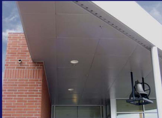
McKINLEY ELEMENTARY SCHOOL 1500 NW 185TH AVE, BEAVERTON OR 97006 COMPLETED 2008 INSTALLER: TT&L SHEET METAL ARCHITECT: ARCHITECTS BARRENTINE.BATES.LEE