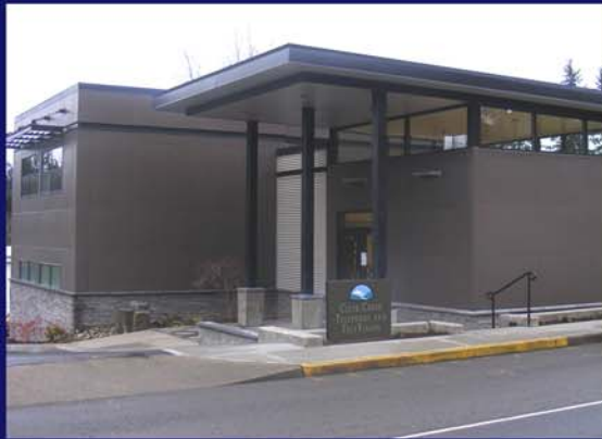
CLEAR CREEK TELEPHONE AND TELEVISION 18238 S FISCHERS MILL RD. OREGON CITY, OR 97045 COMPLETED 2008 INSTALLER: PORTLAND SHEET METAL ARCHITECT: CO-BELLA DESIGN