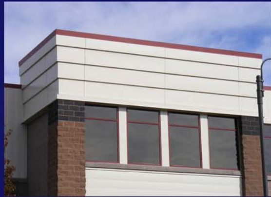
THE BONNETT BUILDING 929 SW SIMPSON AVE. BEND, OR 97702 COMPLETED 2008 INSTALLER: CASCADE HEATING & SPECIALTIES, INC ARCHITECT: STEELE ASSOCIATES ARCHITECTURE, LLC