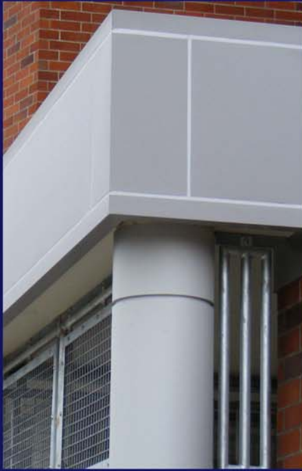
SLOCUM BUILDING 55 COLBURG RD. EUGENE, OR 97401 COMPLETED 2007 INSTALLER: STREIMER SHEET METAL ARCHITECT: TBG ARCHITECTS