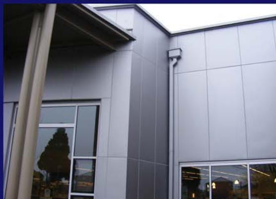
TUALATIN LIBRARY 18878 SW MARTINAZZI TUALATIN OR 97062 COMPLETED 2008 INSTALLER: SKYLINE SHEET METAL ARCHITECT: SRG PARTNERSHIP