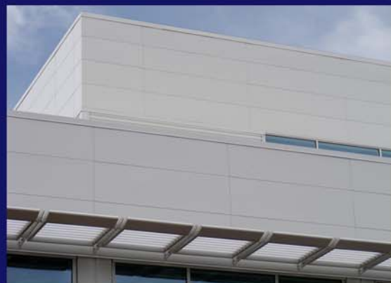
SPRINGFIELD JUSTICE CENTER 230 4TH STREET SPRINGFIELD, OR 97477 COMPLETED 2008 INSTALLER: AL'S SHEET METAL ARCHITECT: ROBERTSON/SHERWOOD ARCHITECTS PC