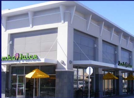
CASCADE STATION 9199 NE CASCADE PARKWAY PORTLAND, OR 97220 COMPLETED 2007 INSTALLER: PORTLAND SHEET METAL ARCHITECT: PERKOWITZ + RUTH ARCHITECTS